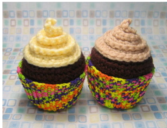
Paper cups (pattern on page 3) crocheted using variegated thread Frosting pattern on page 4